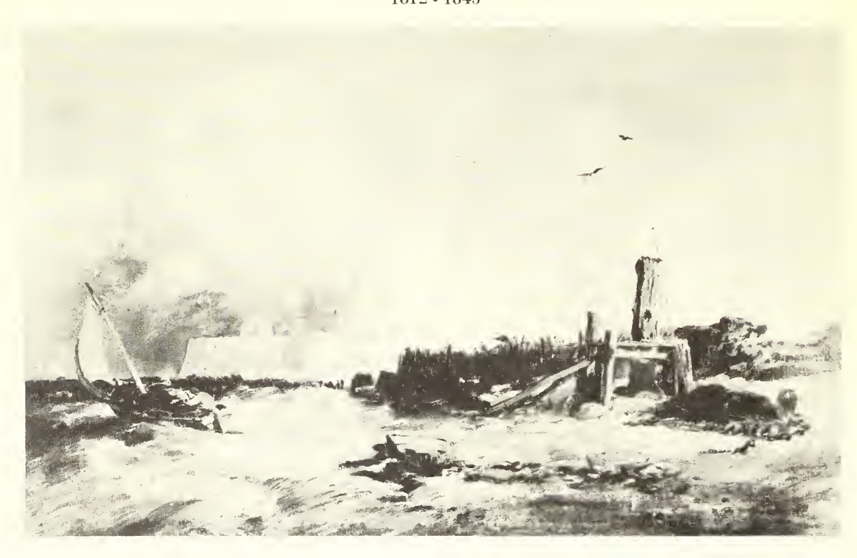
YAWL LEAVING RHODES